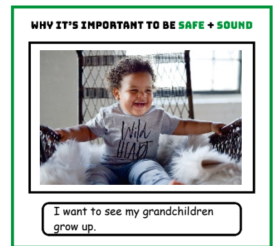
Framing Safety example

Businesses can share their commitment to safety by emailing graphics to safeandsoundcampaign@dol.gov or post on social media using the hashtag #SafeAndSound2018. These could be featured on the Campaign website or in Campaign communications.