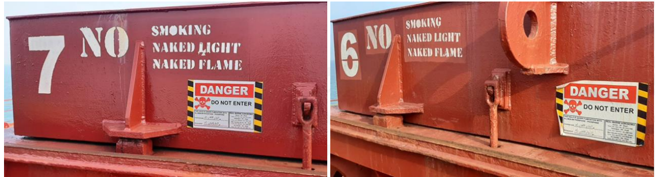
Figure 2. Danger signs affixed to sides of cargo hatches

Instructions for aeration and ventilation was provided. The deck officers were advised on safety precautions and provided with a safety booklet along with one part of the completed voyage checklist.