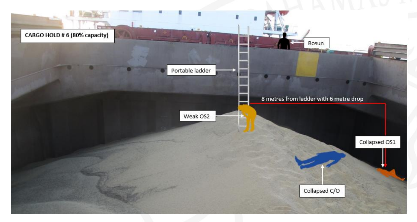
Figure 3. Positioning of crew inside cargo hold 6 at time of casualty

During this time OS1 fetched a portable ladder as hold 6 was only 80% full and therefore access could only be gained with the use of a ladder, when placed inside the hold resting it on the highest point of the soya bean and positioning it against the coaming of the hold (Figure 3).