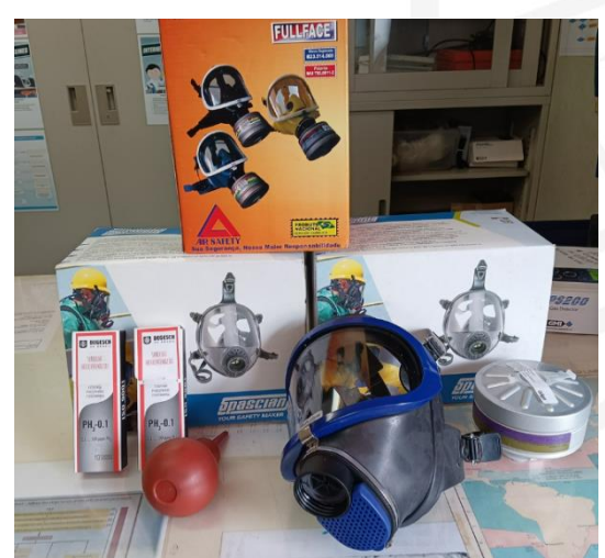
Figure 4. Safety equipment supplied by the fumigation contractors at Paranagua

When the fumigation removal contractors boarded the vessel in Singapore, their gas free certificate indicated that all holds had a phosphine content below 0.3ppm and were considered safe. However, readings were taken using a handheld meter at the level of the hatch coamings – no attempt was made to sample the atmosphere at the level of the cargo in the two holds that were not at full capacity despite low-lying areas being at the highest risk of having phosphine present.